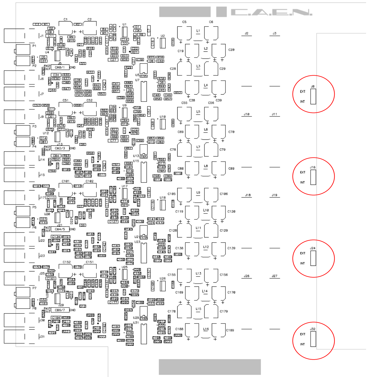
Fig. 2.2: Internal jumpers location 1